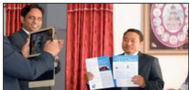
From right: Hon. Finance Minister and IECCD Chief