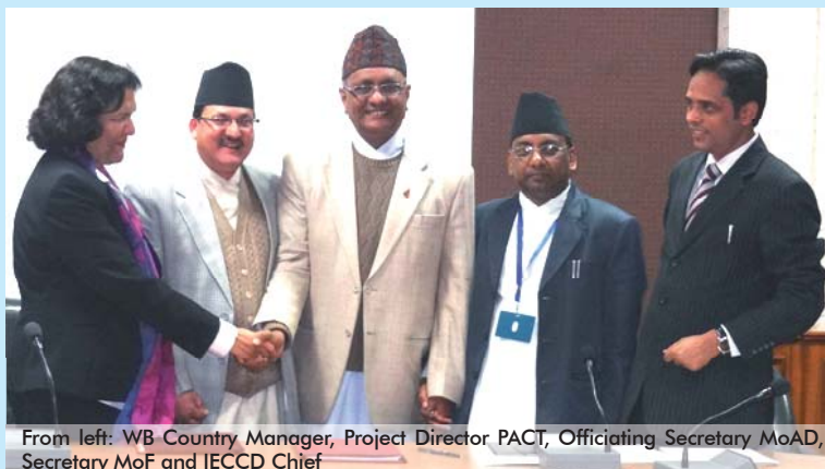
From left: WB Country Manager, Project Director PACT, Officiating Secretary MoAD, Secretary MoF and IECCD Chief

The objective of the project is to improve the competitiveness of smallholder farmers and the agribusiness sector in selected commodity value chains in the project district by (i) helping farmers groups and cooperatives engage in profitable market oriented production and improved access to markets (ii) creating and strengthening industry-wise partnership along the value chain and (iii) reducing existing obstacles to agriculture and food trade. This additional financing removes the restriction of 25 districts, and now the project will be implemented throughout all 75 districts. So that the project would have