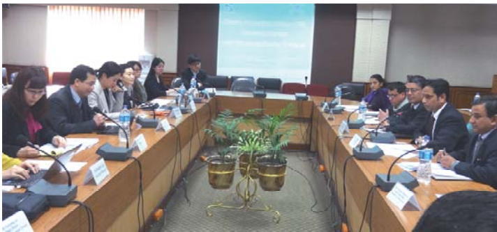
From Left: Korean Delegates and GoN Officials