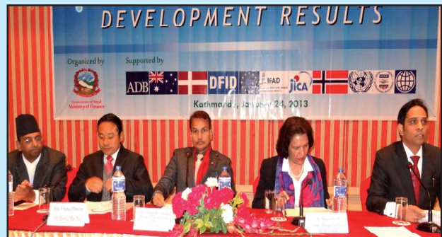
From left: Finance Secretary, Hon. Finance Minister, Hon. Member NPC, WB Country Manager and IECCD Chief